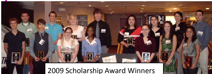
2009 Scholarship Award Winners

Later that evening, we will have our first-ever Scholarship Awards Dinner!