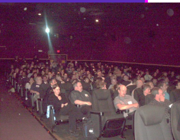
Scholarship Awards Cinema Arts Theatre April 29, 2009