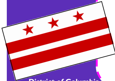
District of Columbia